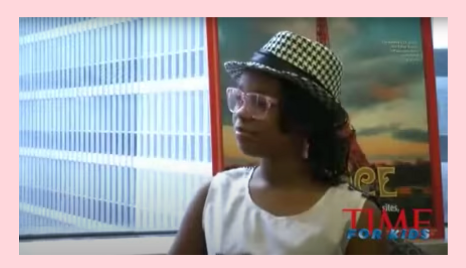
Brad Show Live