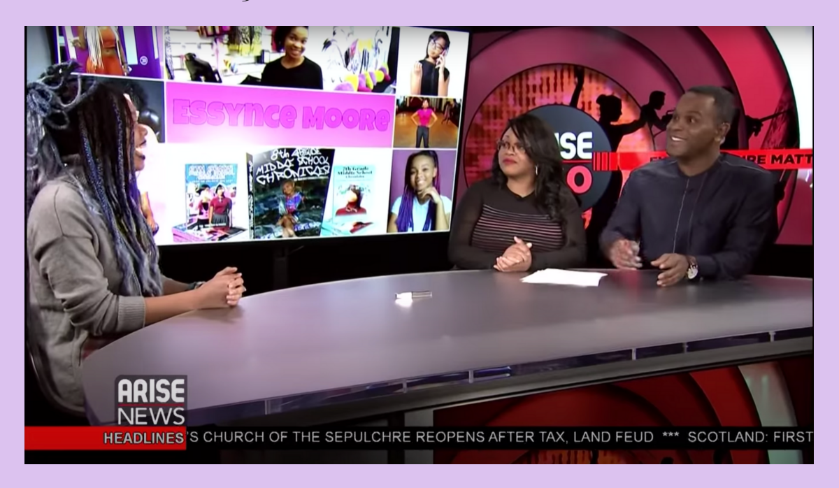
Rightway Management Sounds